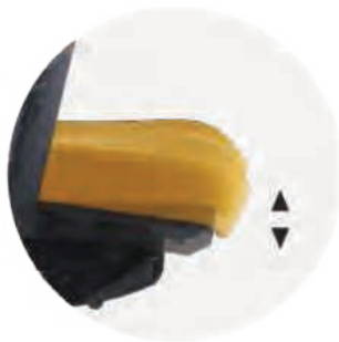
2 Seat Angle Positions (YP)