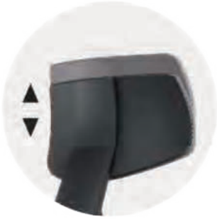
Height Adjustable Headrest