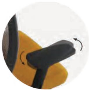
Angle Adjustable Armrest (A78)