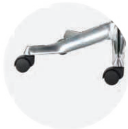
Aluminium Base in Polished Finish