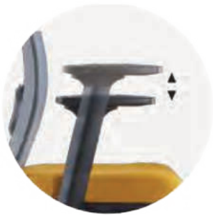
Height Adjustable Armrest (A78)