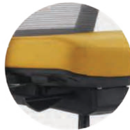
Weight-Sensing Mechanism with Tilt Lock