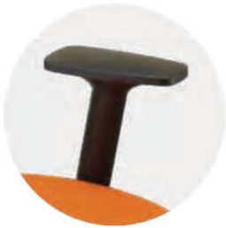
3-Way Armrest with PP Armpad