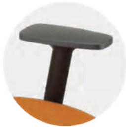
3-Way Armrest with PU Armpad