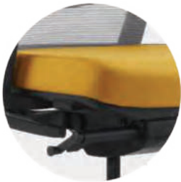
Seat Forward-Tilt, Tilt Lock, Tension Control