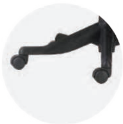
350 Stiletto Base in Black PA-GF