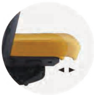
Depth Adjustable Seat (YM & YP)